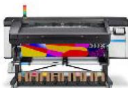
HP Latex 800 Printer