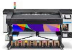
HP Latex 800W Printer