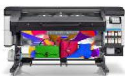
HP Latex 700W Printer