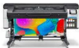
HP Latex 700 Printer